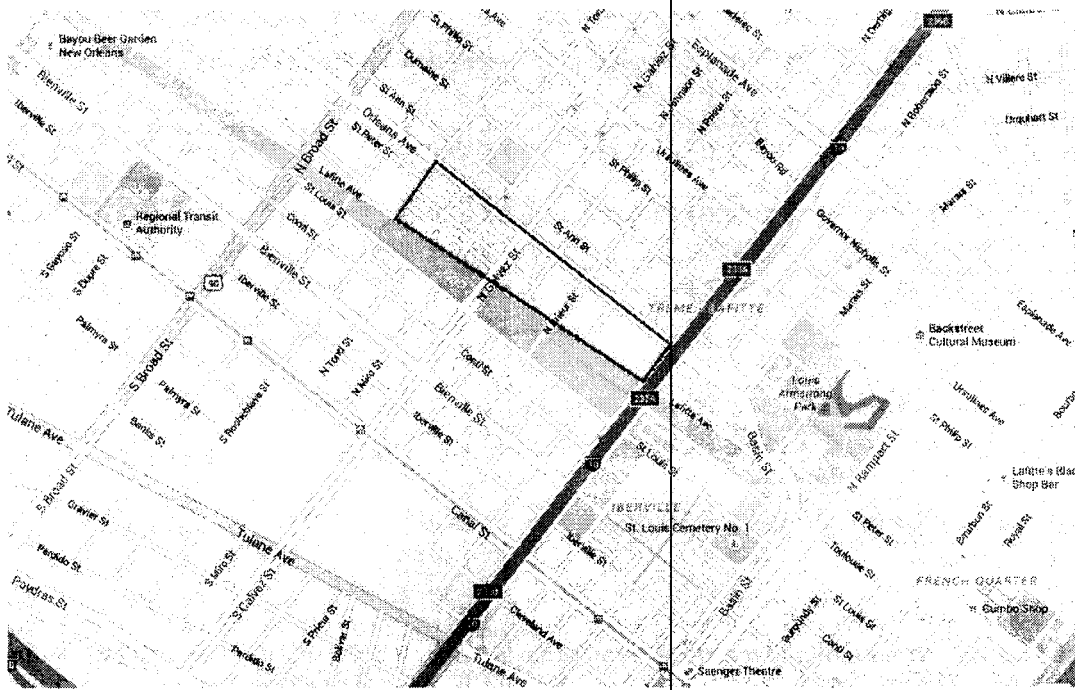
(Faubourg Lafitte, outlined in red, lies alongside Tremé and just on the other side of the I-10 Overpass from the French Quarter)

Dinner in December, and Community Crawfish Boil in March. These events will allow us to gather, celebrate our history and culture, and reinvigorate ourselves and our community.