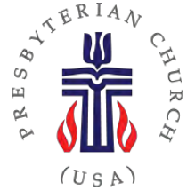
Committee on Theological Education