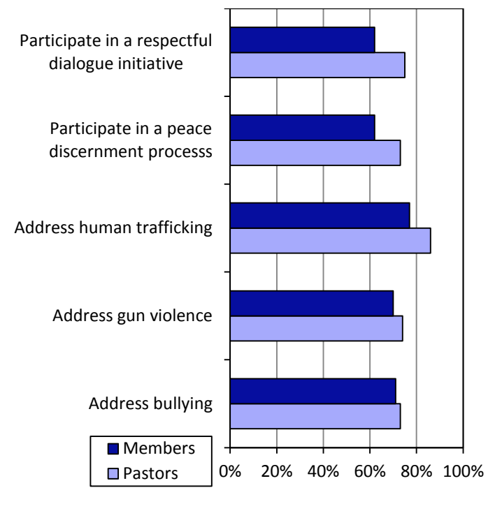
Figure 2. Importance of Efforts by the Presbyterian Peacemaking Program to Help Presbyterians to:

✓ Although members and pastors differ significantly in their familiarity with various efforts of the Presbyterian Peacemaking Program, they don't differ as much in their opinions about the importance of each of these efforts. (See Figure 2 for comparisons.)