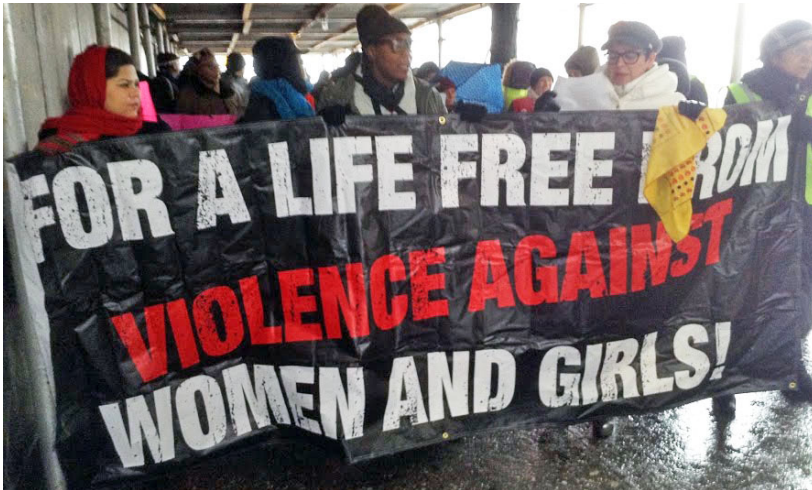
Photos from 2013 CSW.