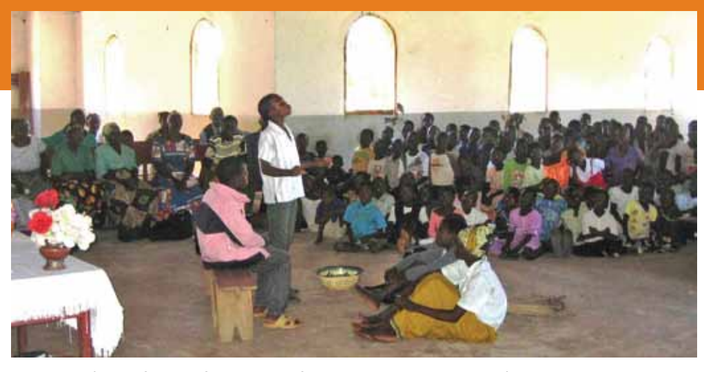
Youngsters from a Child to Child Health Club in northern Malawi perform a skit to educate other children and their parents about healthy sanitation and personal hygiene practices. At another Child to Child Health Club project, mothers learn how to grow and prepare more nutritious foods. The Child to Child Health Clubs received funding in 2010 from the annual Healthy Women Healthy Families Mother's Day Project.

Visit http://gamc.pcusa.org/ ministries/big-tent/ for more information and to register.