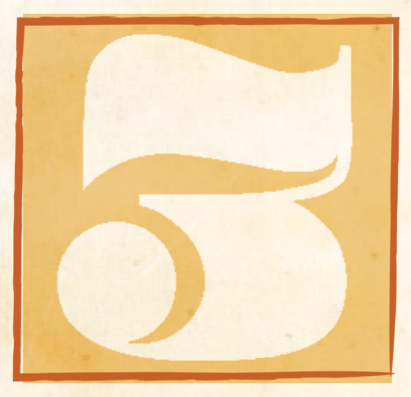
TIPS & MYTH BUSTERS