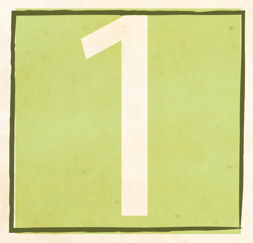
TESTING YOUR SOIL