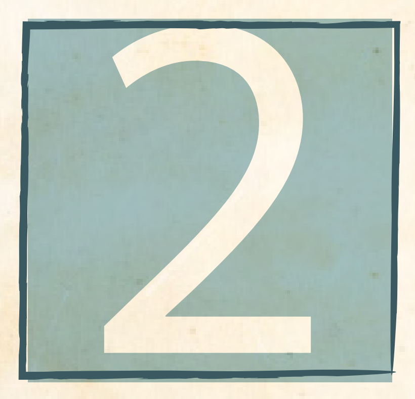
BUILDING YOUR GARDEN