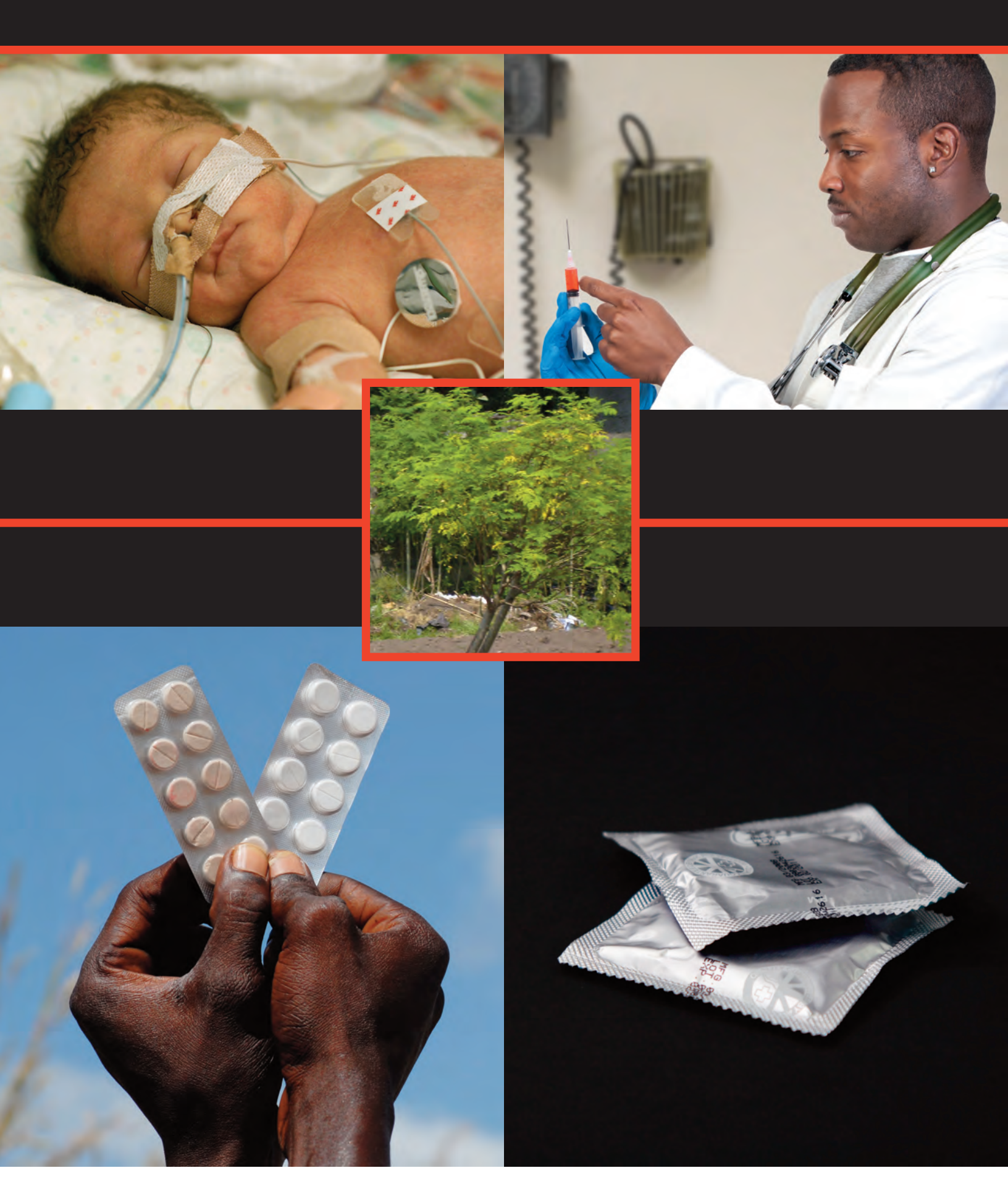
The Advisory Committee on Social Witness Policy (ACSWP) http://gamc.pcusa.org/ministries/acswp