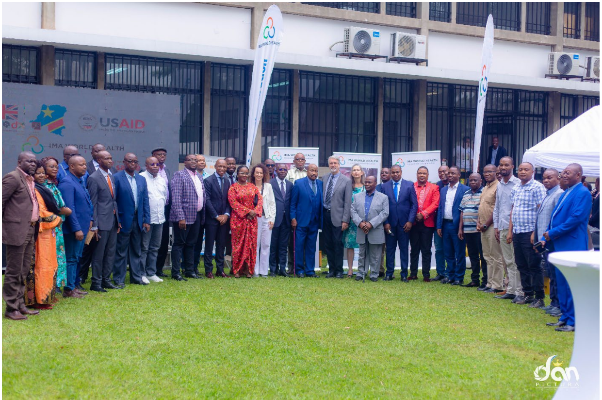
SANRU Team and other IMA Partners