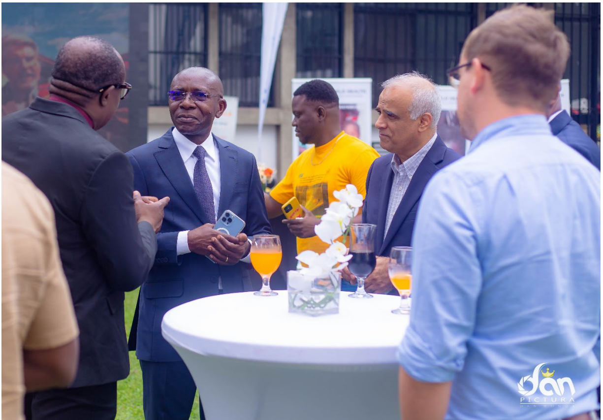
The Secretary General of the Ministry of Health