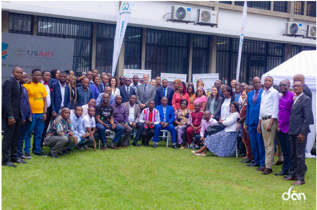
IMA Team 2023