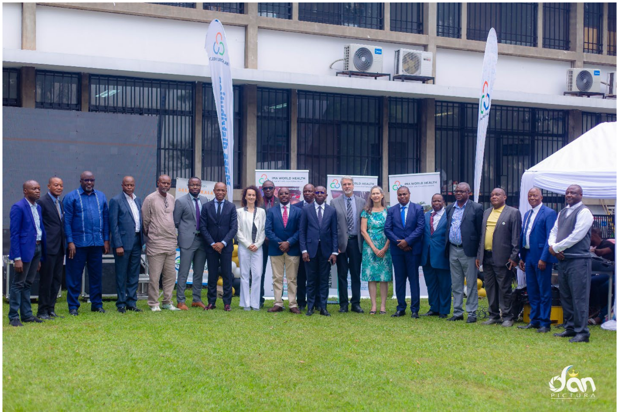
Officials from the Ministry of Health