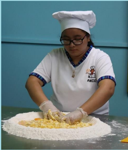
Preparation and sale of bread

Sixty-five people participated in small business ventures to improve the economic and psychosocial well-being of their families, and we estimate that 325 people benefited indirectly.