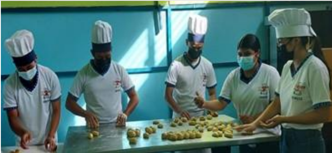
A group of young men and women from UTZPAN (meaning “Good Bread”) are preparing bread to sell. Mixco, Guatemala