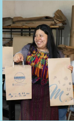
Production of paper bags for gifts and small businesses