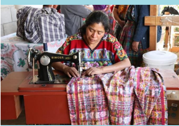
Purchase of sewing machines to sew textiles