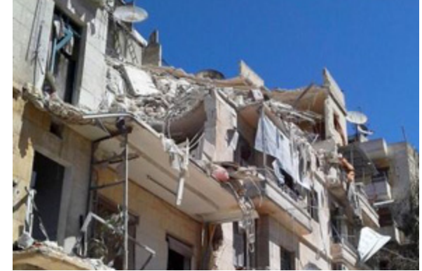
Syria update. Five years of war has left