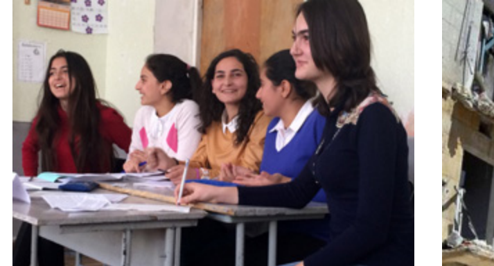
Giving catalog. Choose direct giving to