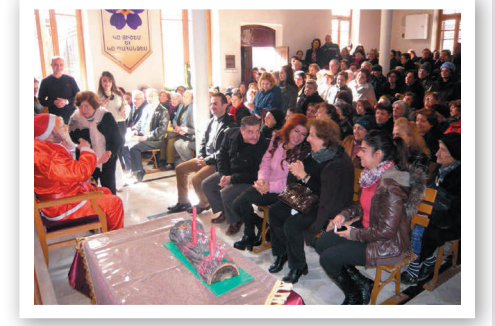
In 2017, people finally came out of their homes feeling happy, secure and hopeful for JMP-hosted holiday gatherings. Because of the program's deep local roots in Damascus, Kamishly and Aleppo, donors can also give personal blessings like Easter clothes and church banquets.