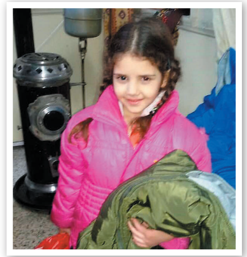
Peace and Hope. Aleppo schools opened without bombs for the first time in seven years. JMP helped relieve the huge strain on parents with new backpacks and winter coats for hundreds of kids.