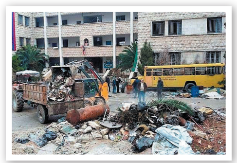
Rebuilding begins. Millions of internally displaced people hope to restore their properties, but the task is daunting, while daily life is still a great struggle and dangers remain.