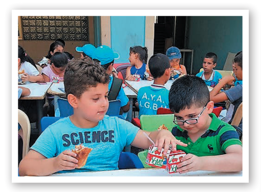
Safe children. JMP blessed almost 600 children with one-day summer school programs in Aleppo, which resumed thanks to increased security.