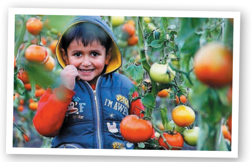
In the Gavar, Gegharkunik region of Armenia, a young family runs a fruitful greenhouse business, thanks to a microloan and mentorship through JMP.

International Network and to fund expansion of the project to help more budding business owners realize their dreams.