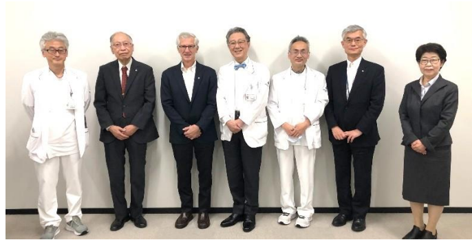
JM Board Members