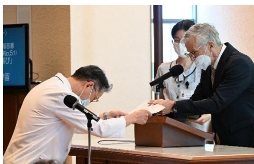
Appointment Letter Presented