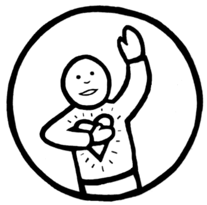
Image description: Inside a circle is a person is holding a heart to their chest with one hand, and the other hand is up and facing out. The person's mouth is open.