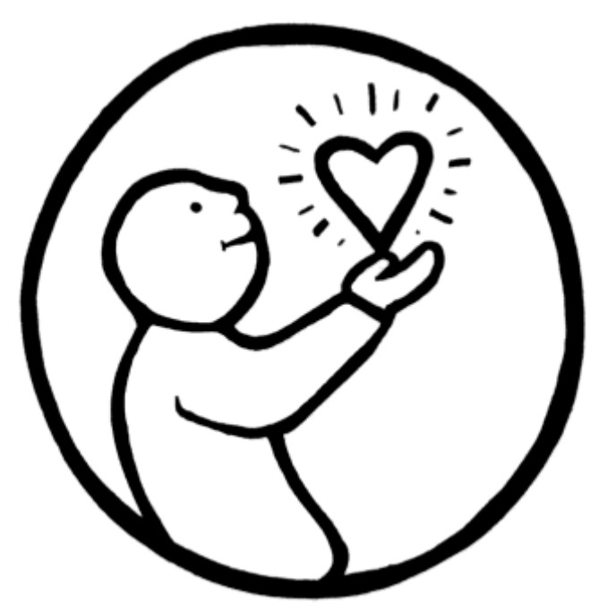
Image description: Inside a circle is a person lifting up a heart. The person is smiling. \pmb{Praise}