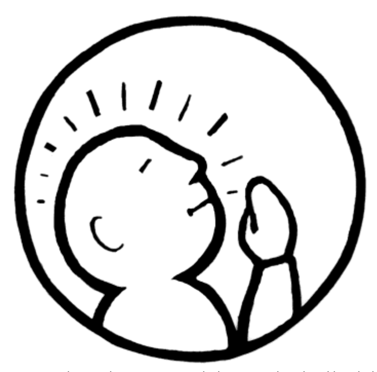
Image description: Inside a circle is a person with their eyes closed and head tilted upward. Hands are in a prayer position in front of them.