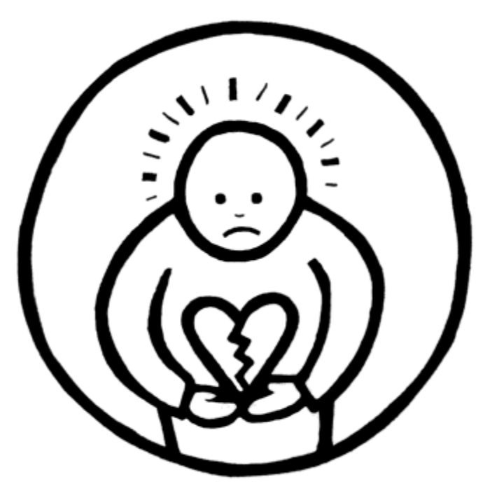
Image description: Inside a circle is a person holding a broken heart and looking down. The person is frowning. Confession