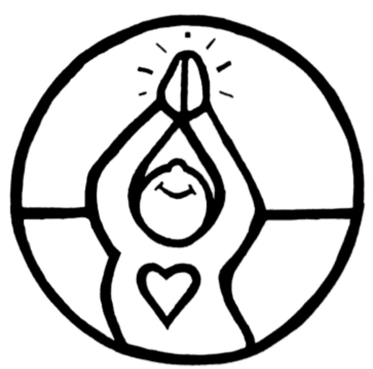
Image description: Inside a circle is a person with prayer hands above their head, they are looking up, and a heart is on their chest. The person is smiling.