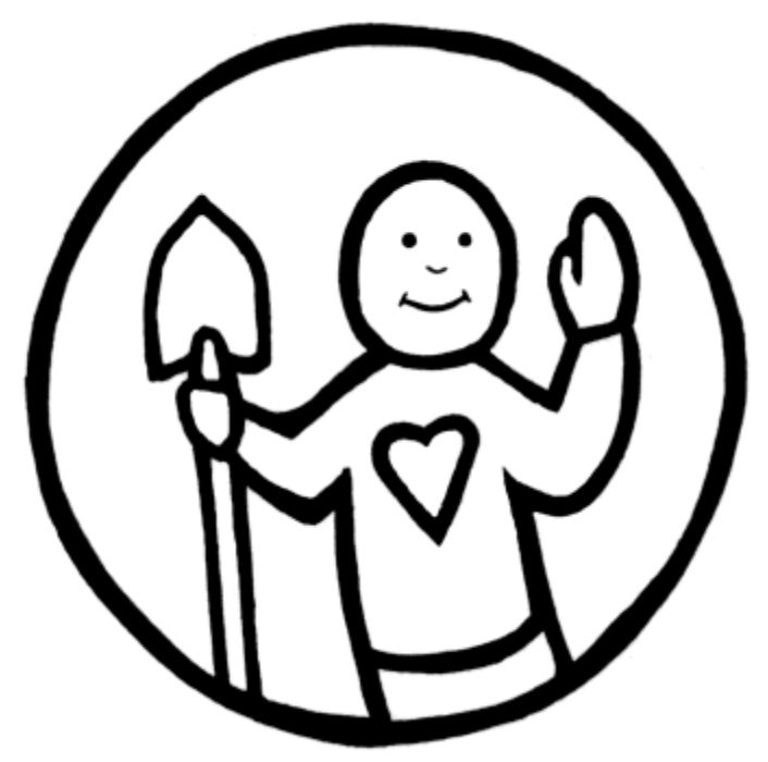
Image description: Inside a circle is a person has a shovel in one hand and the other hand appears to be waving. A heart is on the person's chest. The person is smiling