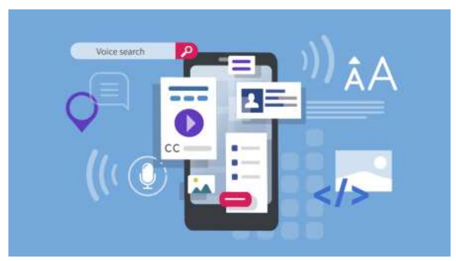
Image Description: Light blue background, with a cell phone in the center. All around the cell phone are different tech symbols including: voice search bar, text icon, CC icon, picture icon, etc.

Covid-19 has impacted our lives in many ways, most of them negative. However, some benefits have come out of this time. Many meetings have moved from in-person to online platforms. In many ways, meetings and worship have become more accessible for many of us with disabilities, but these formats have presented their own challenges. Since I am most familiar with Zoom, and since the basic commands are usable with a screen reader, I will discuss it in my examples. Here are some things that churches and other governing bodies can do to make online meetings accessible to most users.