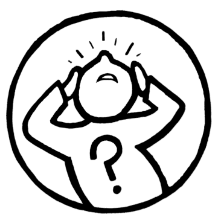
Image description: Inside a circle is a person is looking up, has hands placed on cheeks, and a question mark on his shirt. The person is frowning in concern.