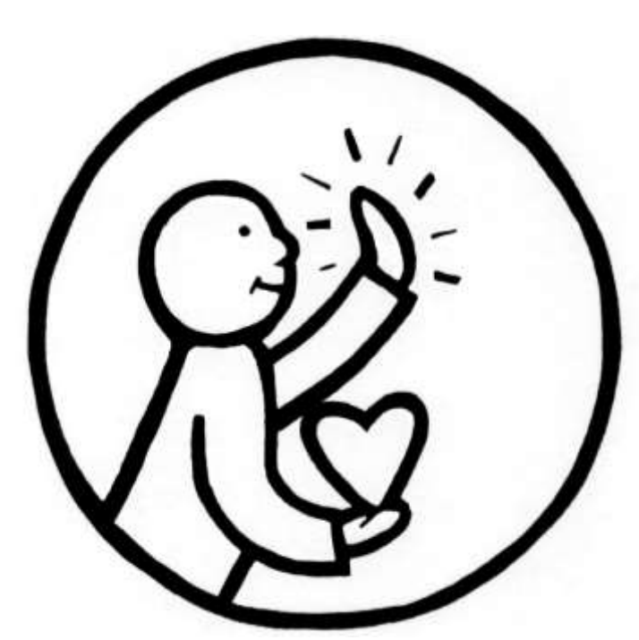
Image description: Inside a circle is a person holding a heart with one hand and lifting the other as if to give someone a high five. **Blessing**