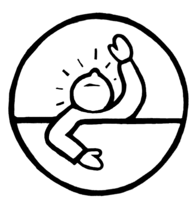
Image description: Inside a circle is a person is holding onto a half wall, looking up, with one hand in the air. Petition