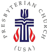
Committee on Theological Education